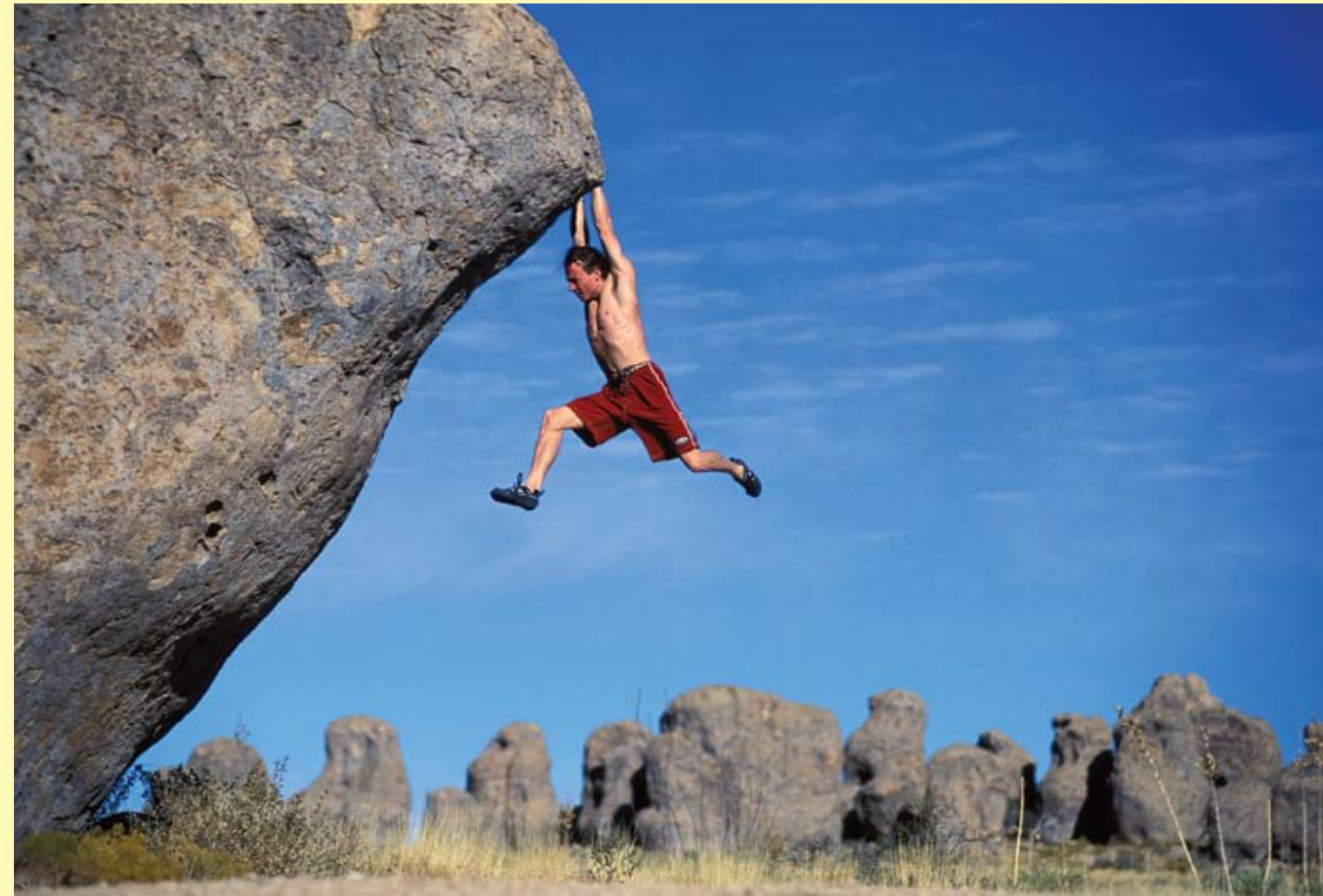
Timy Fairfield, one of the world's strongest rock climbers and a New Mexico native, bouldering at City of Rocks State Park in southern New Mexico. This image was shot for Climbing magazine and was subsequently published in magazines and ads all over the world. Nikon N90s, Nikkor 80-200mm f/2.8 lens, Fuji Velvia Film.